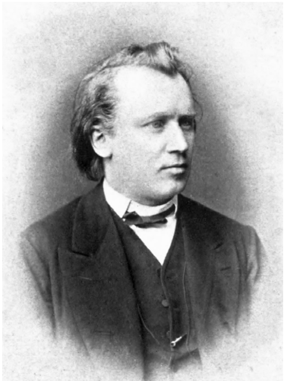
Brahms c. 1872

In 1860, by now recognised as a young composer of significant work, Brahms moved to Vienna, where he lived for the rest of his life and where it was impossible to ignore the social